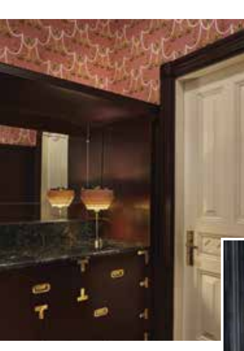
CITY SANCTUARY Clockwise from above: One of the hotel's new guest rooms; a renovated bathroom; the hotel's newly restored wide iron staircase; larger apartments are available for extended stavs.